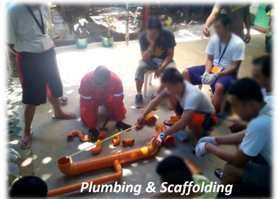
Plumbing & Scaffolding

In our partnership with the nearby drug rehab facility, 25 residents completed the Plumbing and Scaffolding course. An additional 20 drug rehab patients are taking the second Plumbing and Scaffolding course. We have also conducted the financial literacy and spiritual foundations course with them.